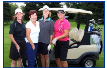
Leo Kirwin Golf Tournament