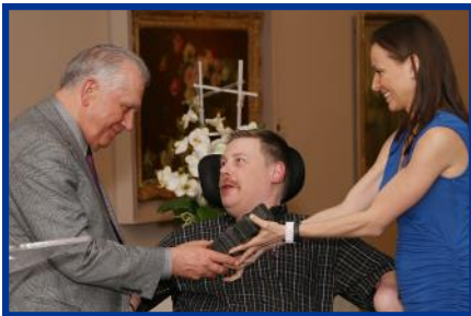
Salute to Laudable Londoners