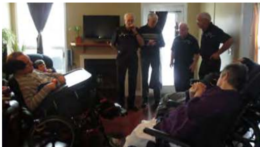
Everyone enjoying the Christmas melodies (left)