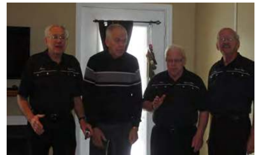
Members of the 'Back in Time' Quartet