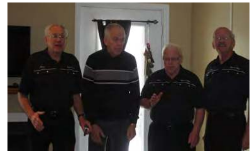
Members of the 'Back in Time' Quartet