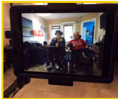
Above—the photo Jay took!