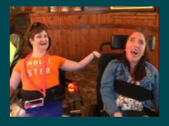
"Shout out to all our staff for encouraging people to go out and enjoy their community!"